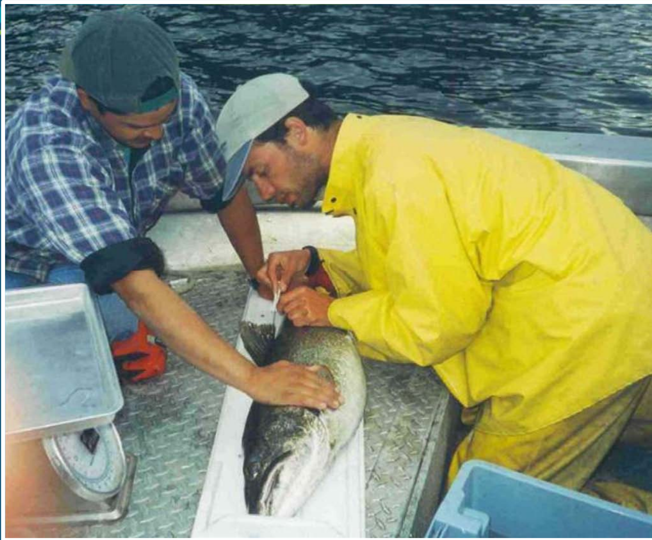
Biopsy of large trout at Pinchi Lake.