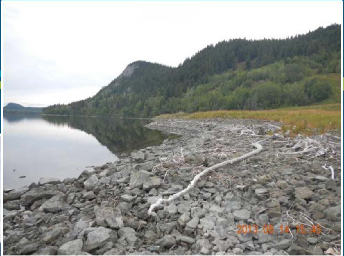
Rip rap protecting calcine waste (2013).