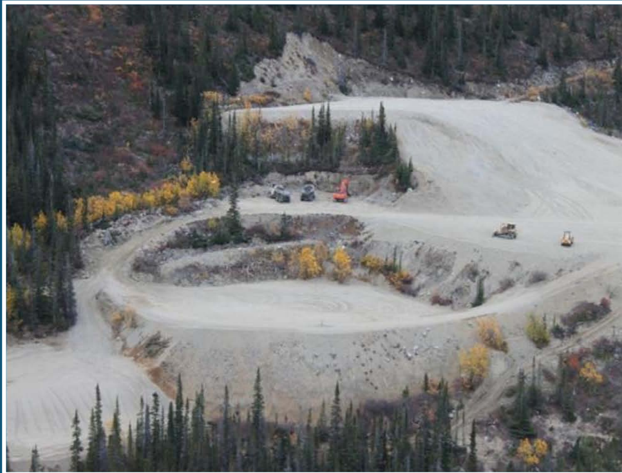
Tailing pond area after reclamation (2012).