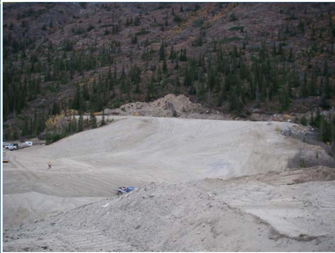
Remediation in progress at the former mill site (September 2012).