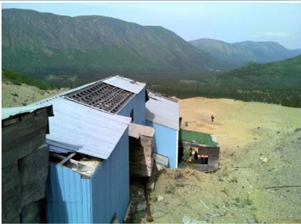
Mill building prior to reclamation (2012).