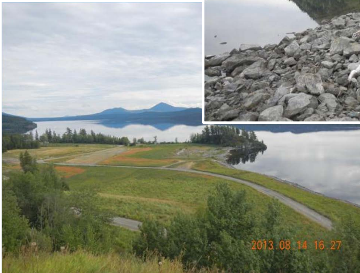
Reclamation of calcine waste dump and lagoons (2013).