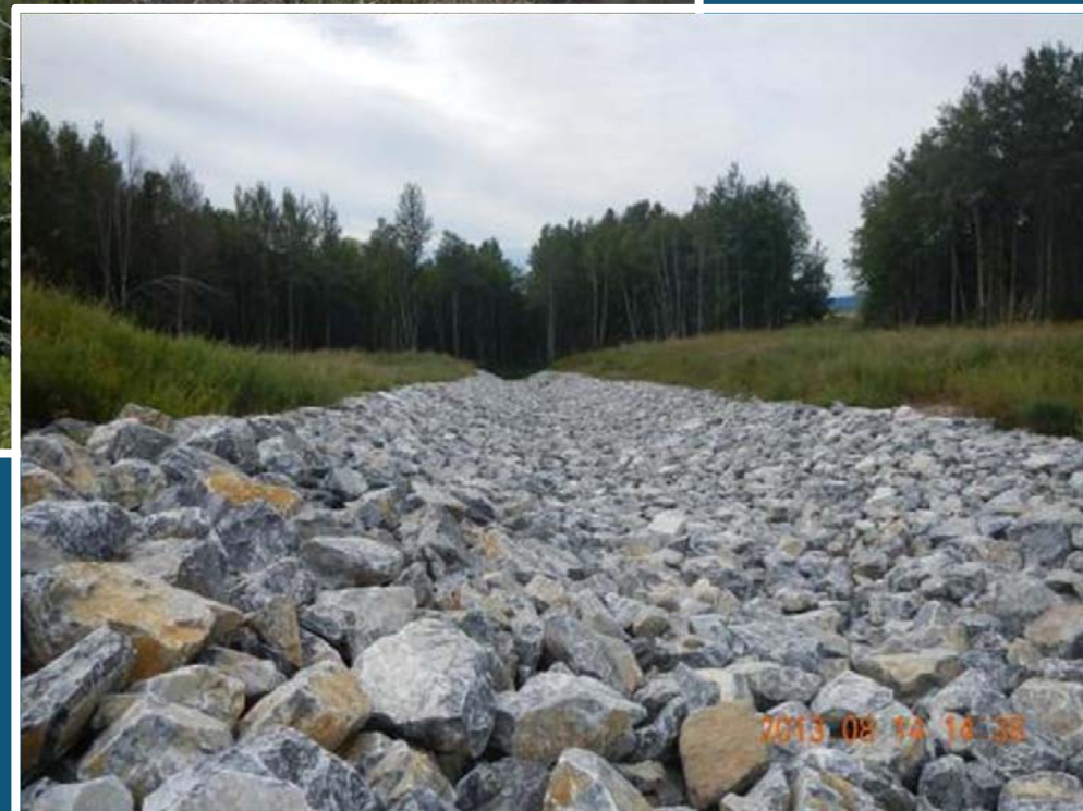
Active tailings impoundment spillway.