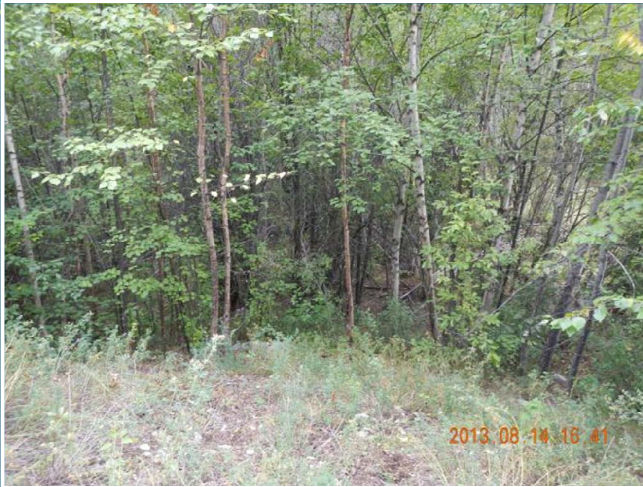
Reclaimed 400 dump (2013)