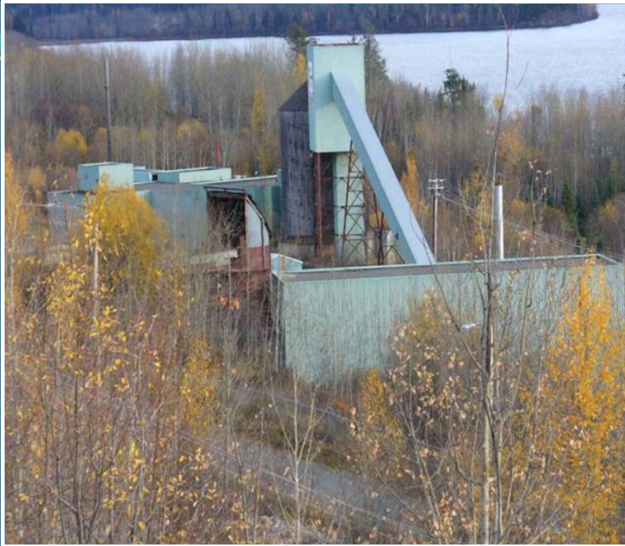
Mill site prior to reclamation.