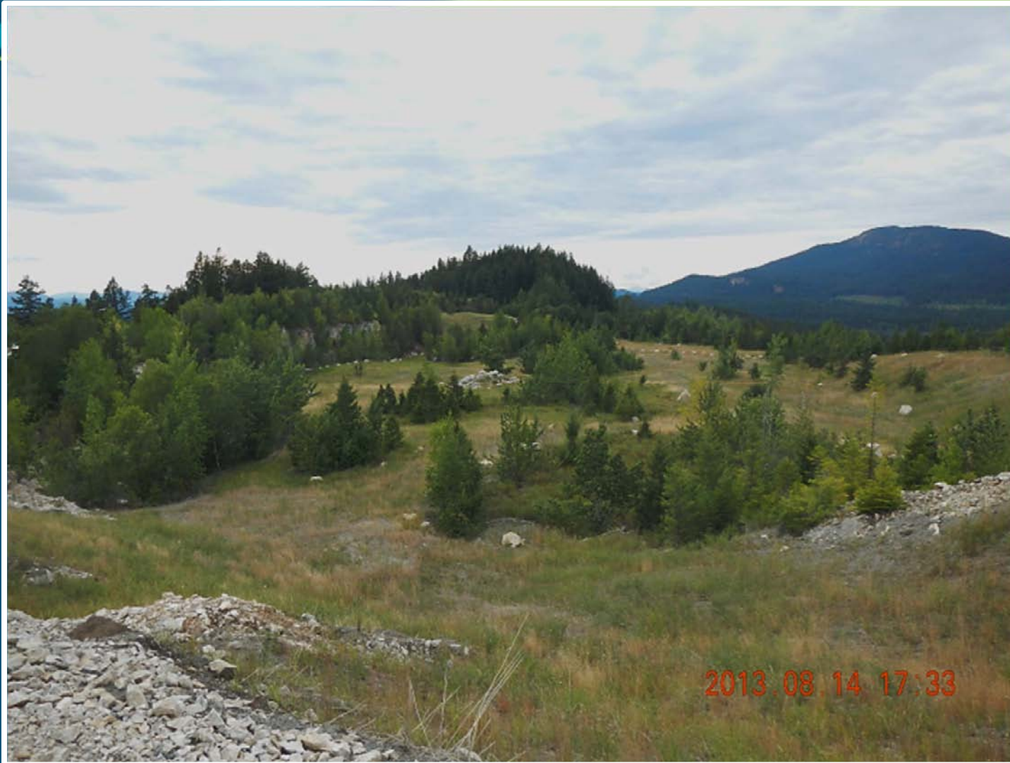
Reclaimed main zone pit area (2013).