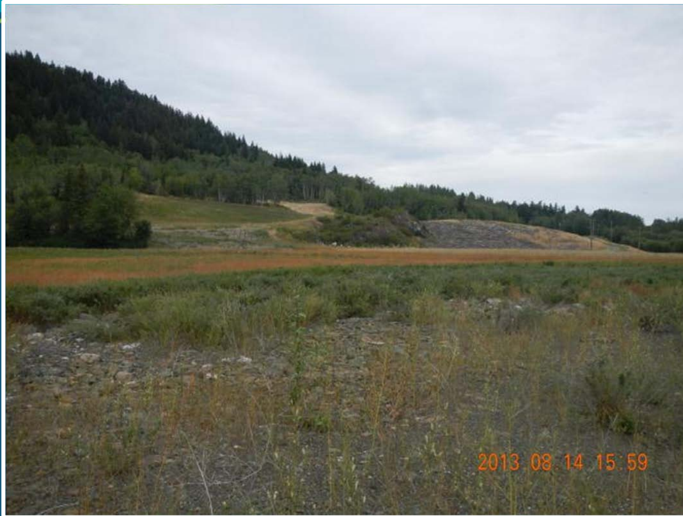
Reclaimed mill site (2013).