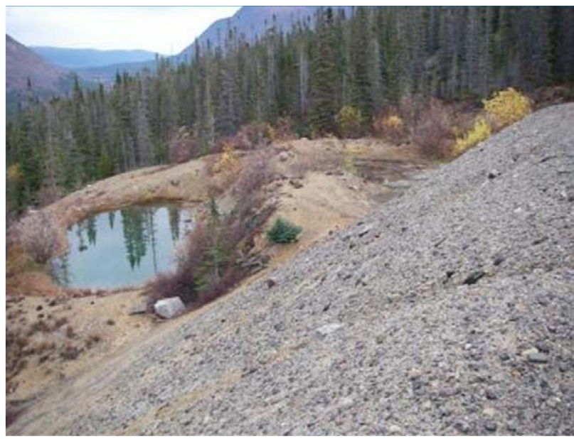
Sedimentation pond prior to drainage diversion (2012).