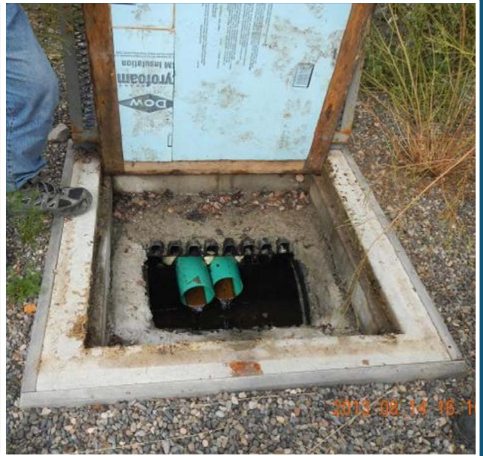
750 portal closure (left) and 750 portal drainage monitoring (right).