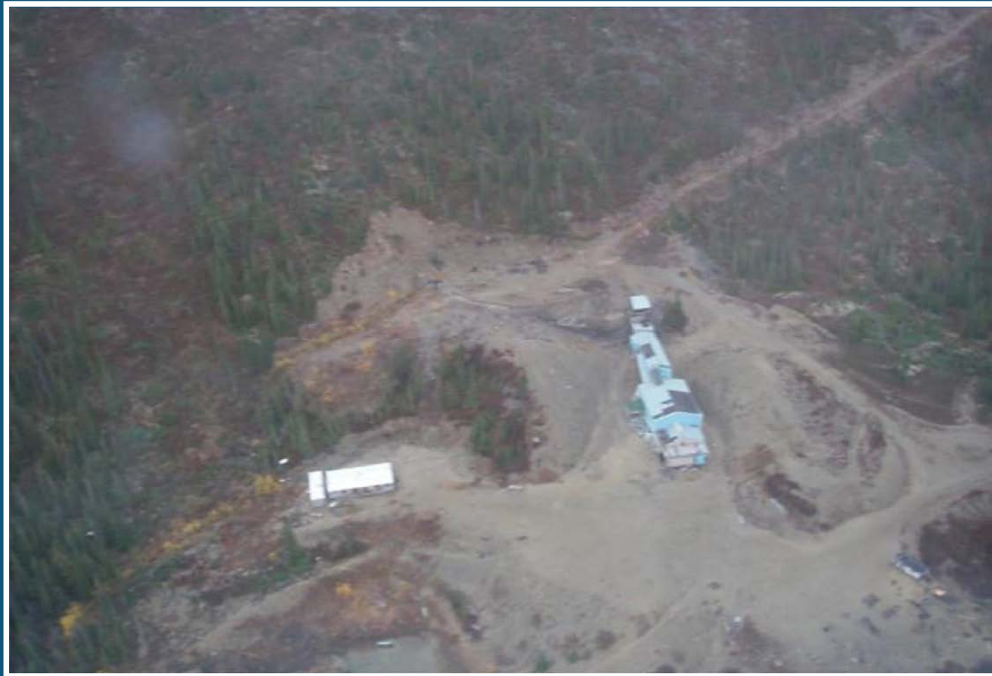
Mill building, trailers and mill pads prior to reclamation (2008).