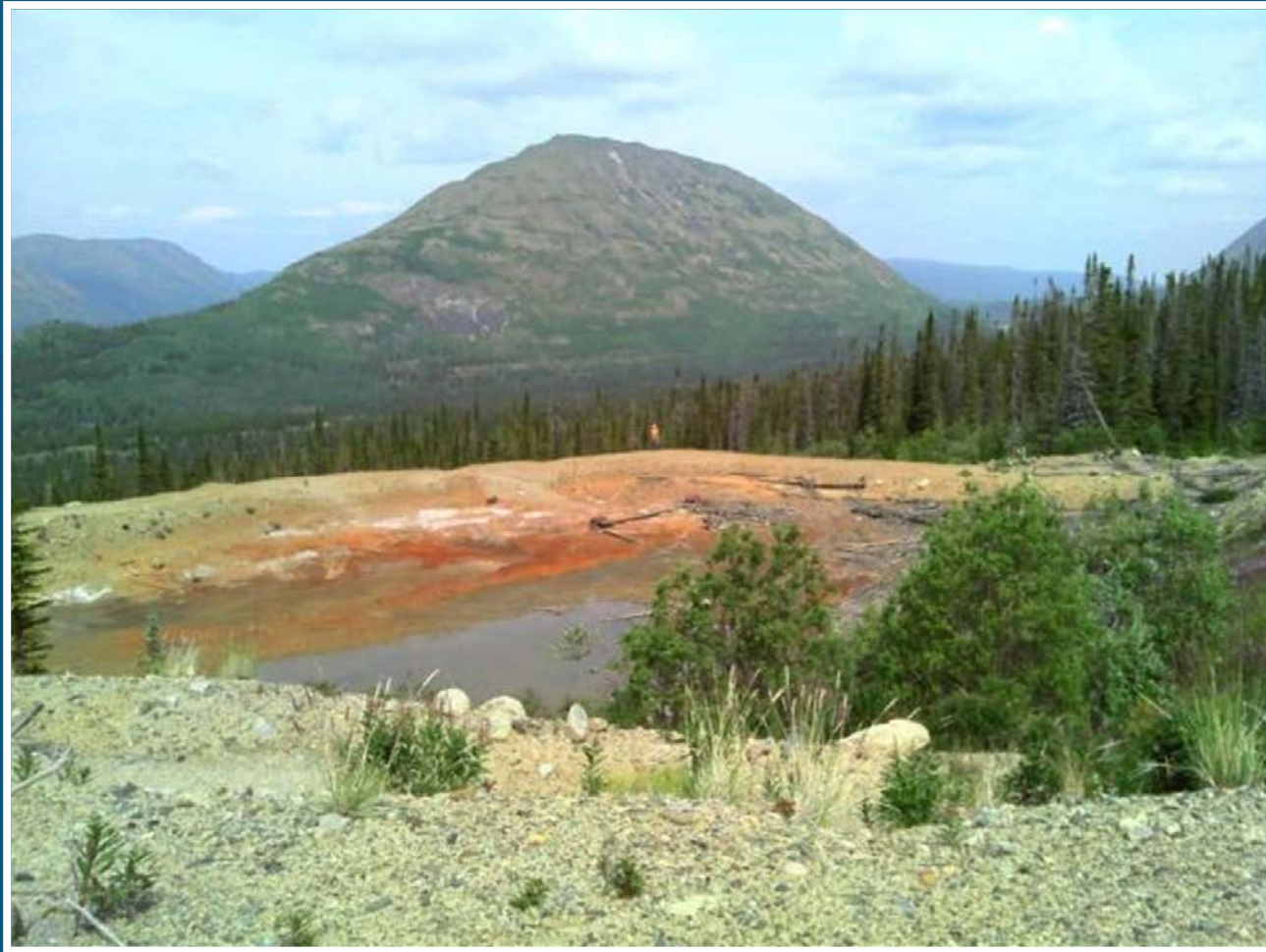
Tailing pond prior to reclamation (2012).