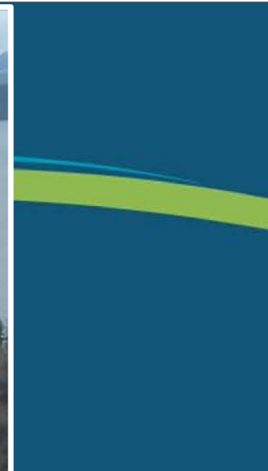
Tailings impoundment before reclamation.