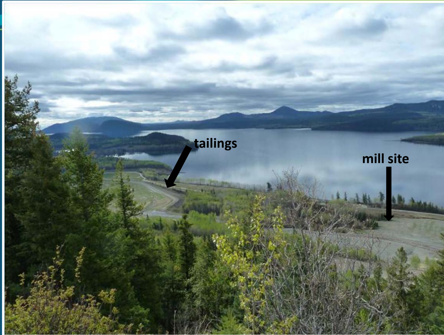
Overview of mill site and tailings impoundment, post-reclamation (2013).