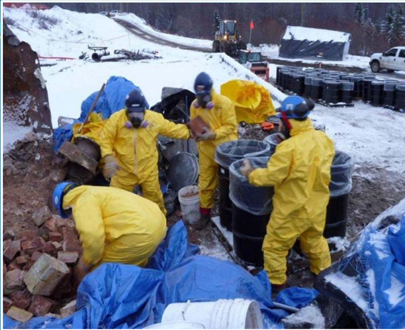
Workers preparing roaster soot and brick work for offsite disposal.