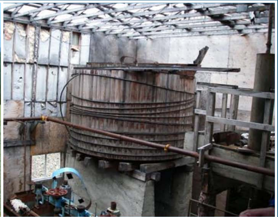
Remaining milling equipment, prior to reclamation (2008).