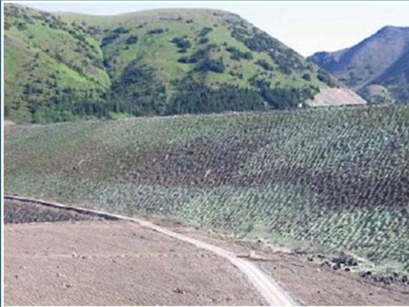
Hydroseeding in progress on dam face (August 2011)