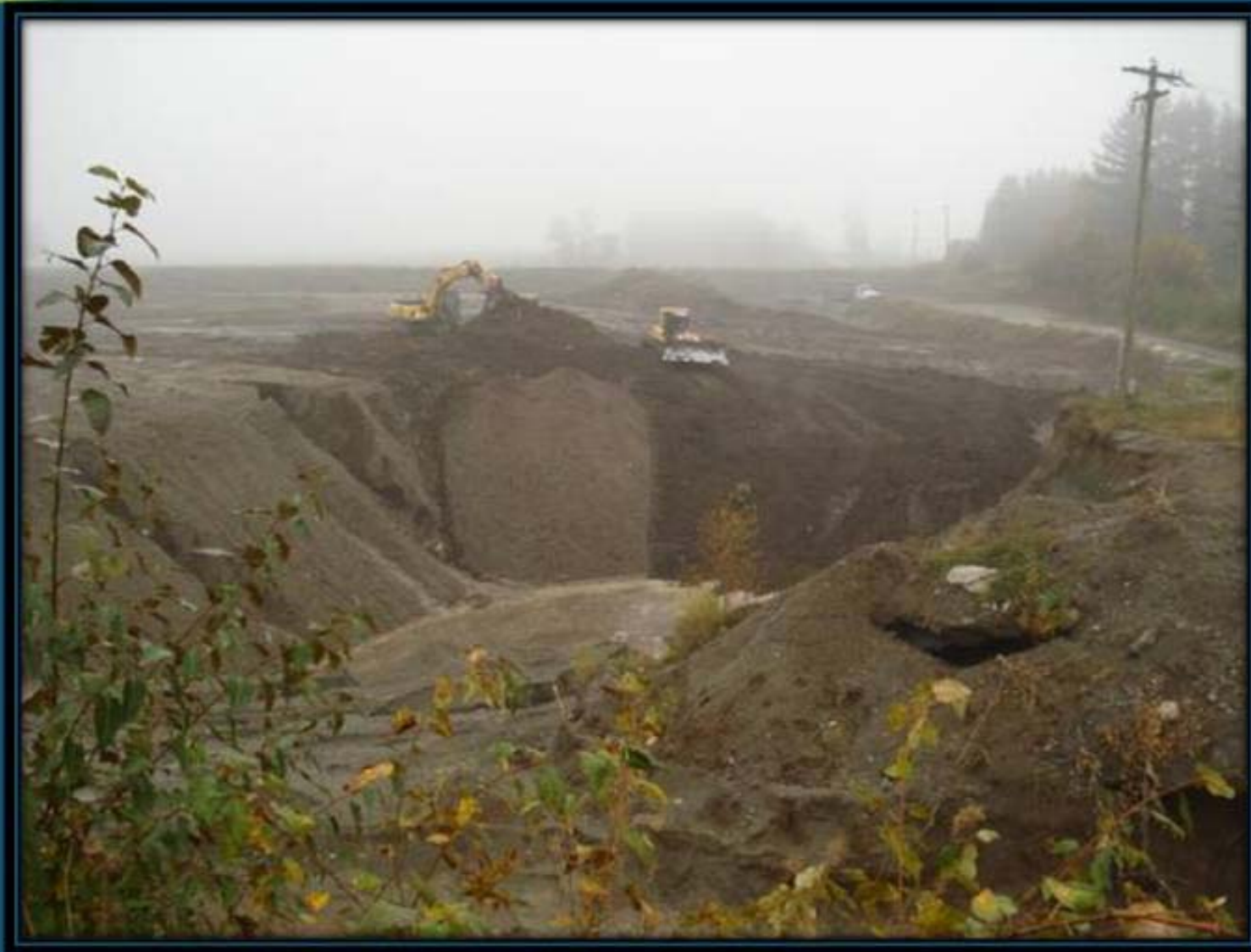
Clean backfilling progress (2009)