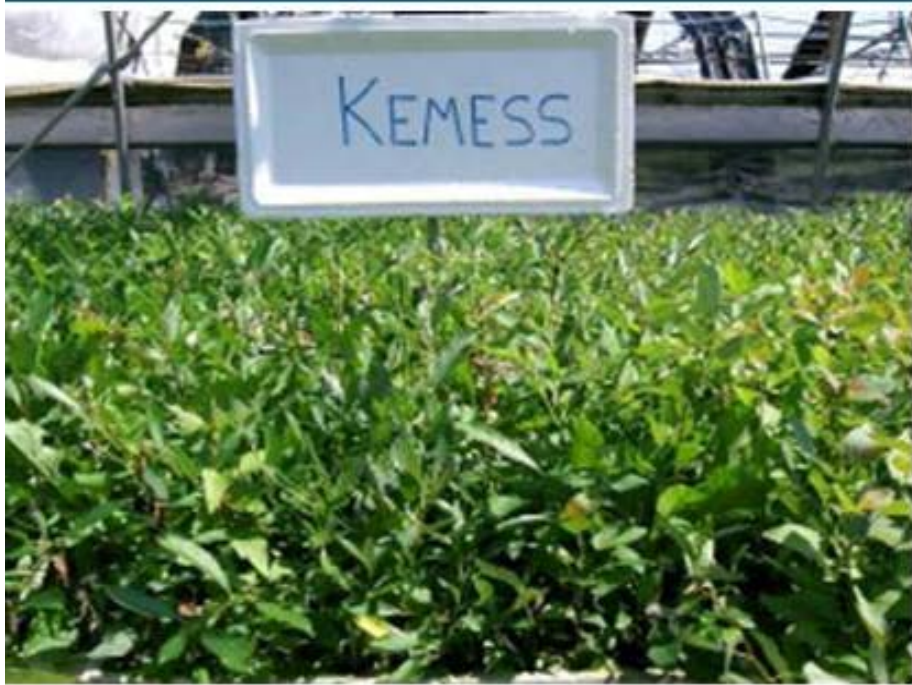
Kemess willow at Woodmere Nursery