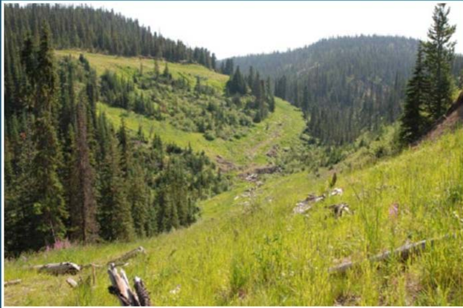
Mill Creek Access Road Reclamation (work completed 2005, photo taken 2009