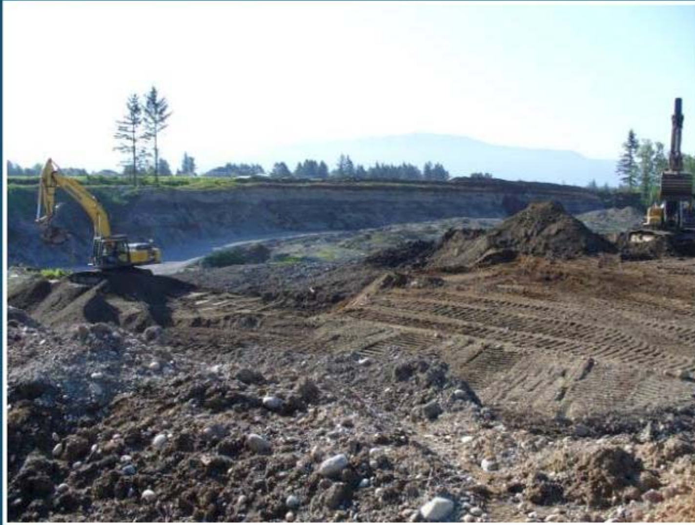
Clean construction fill backfilling (early stages)