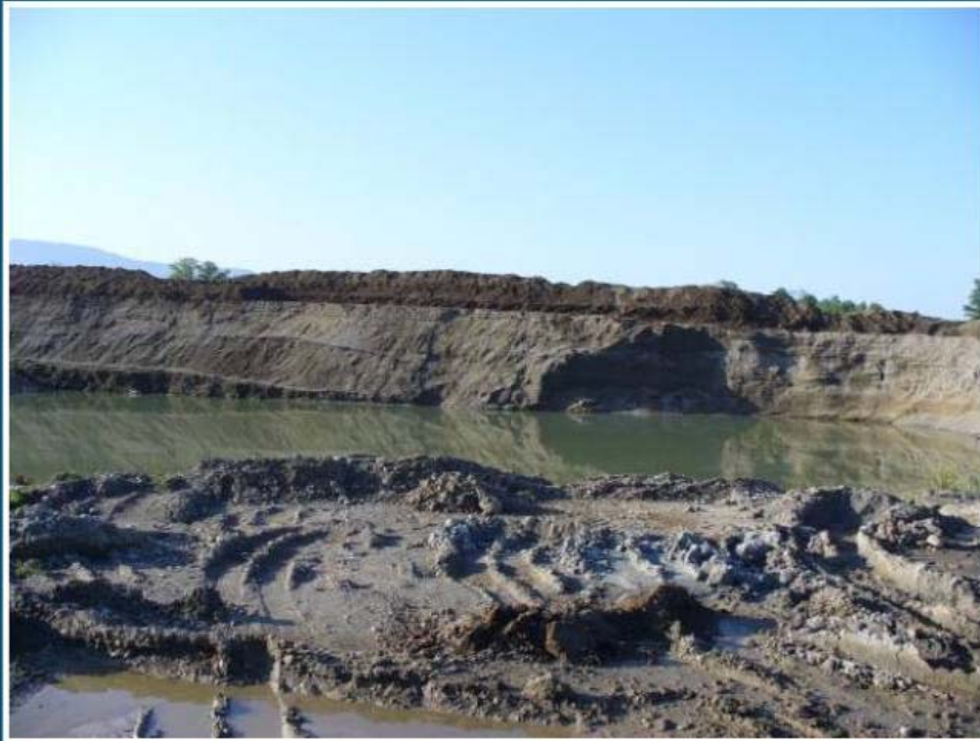
Depleted gravel pit (2007)