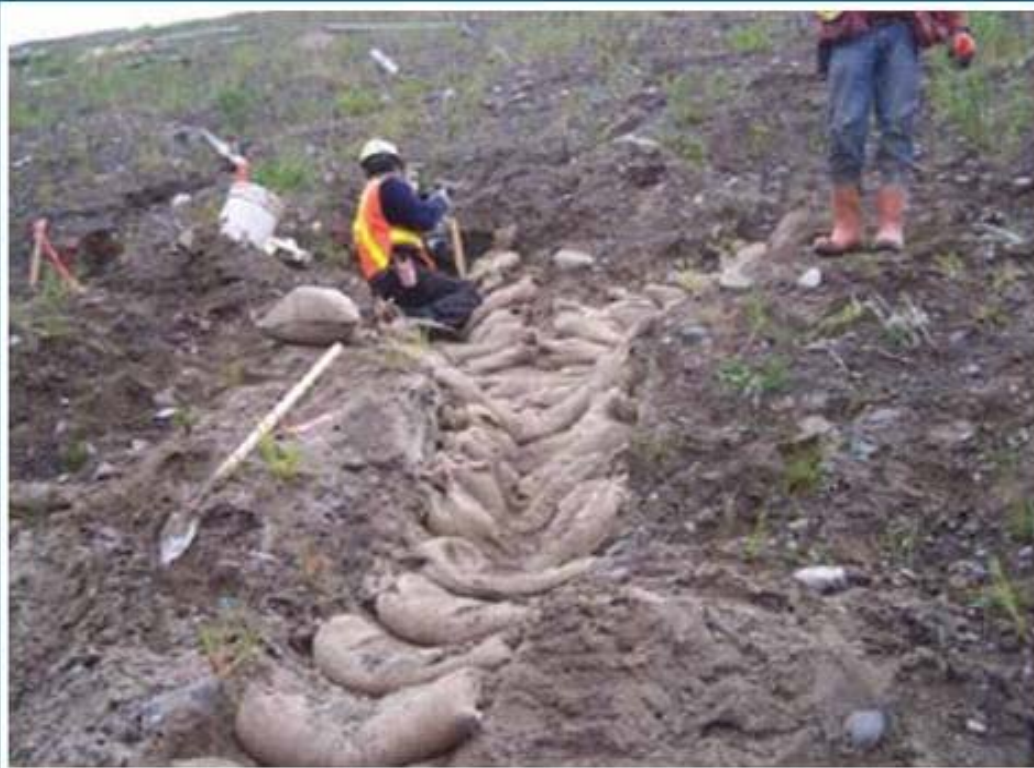
Peat and barley filled burlap armouring on dam face (August 2011)