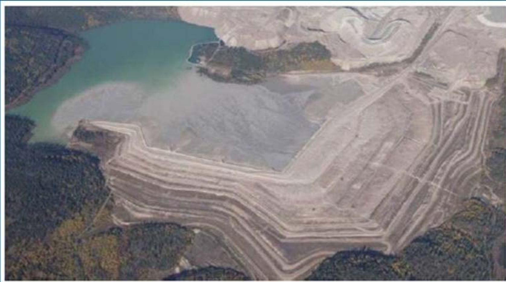
Tailings dam embankments of coarse tailings sand