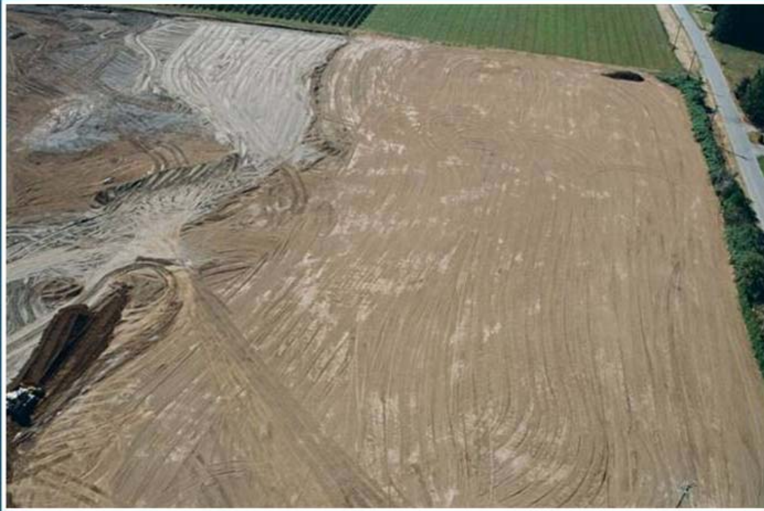
Aerial view of completed surface preparation (2010)