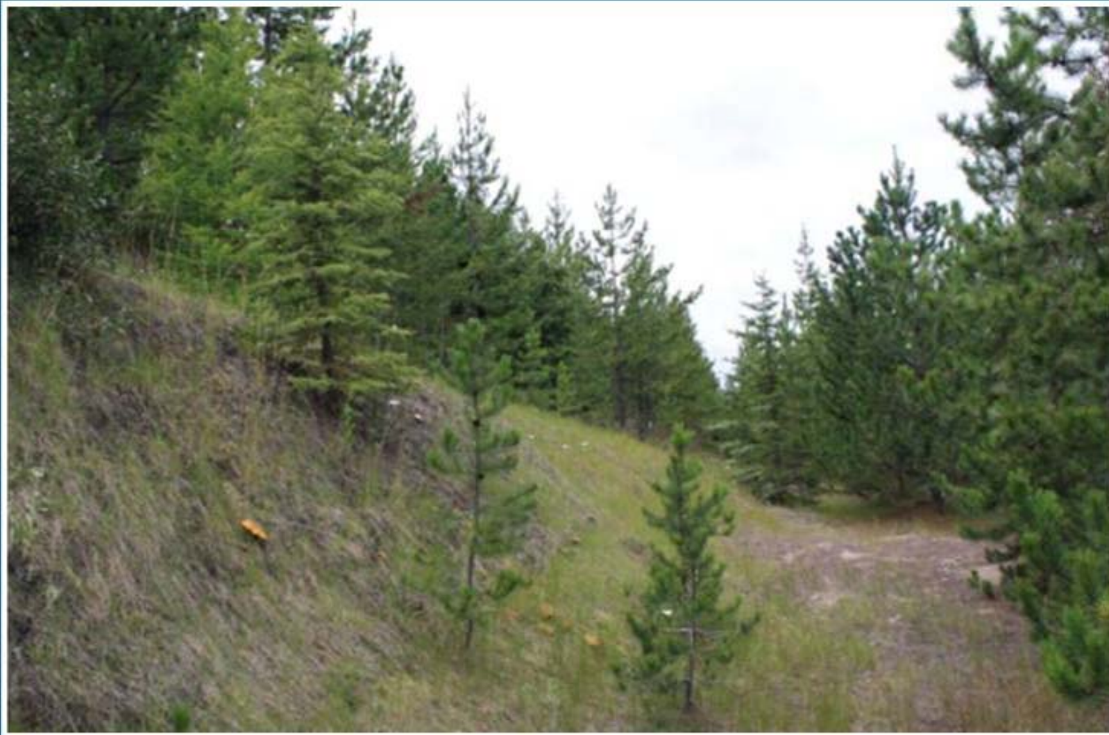
Successful reproduction of trees (north dam, tailings pond 1)