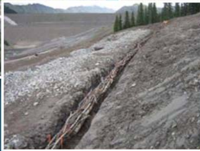
Borrow 10: before (left) and after (right contouring); Live pole drain at Borrow 10 (center)