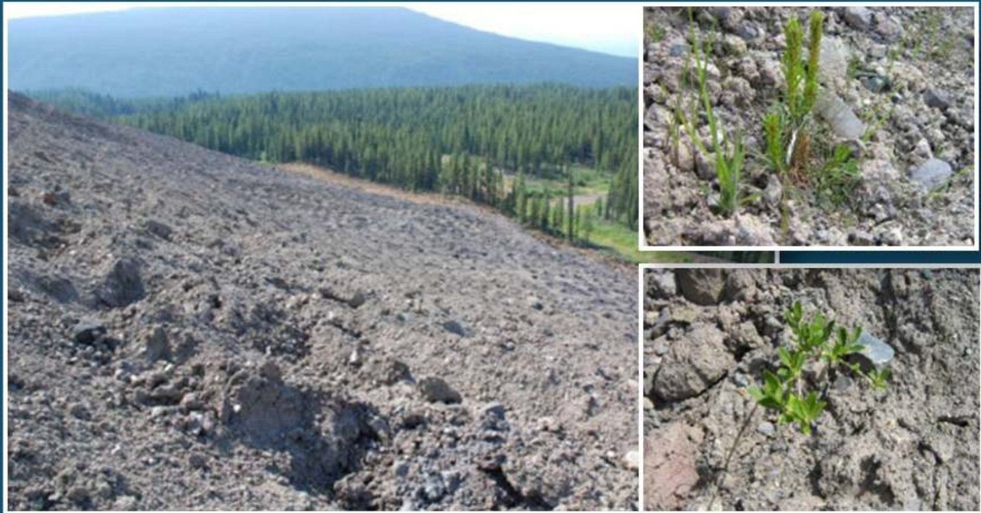
Waste dump resloping, surface preparations showing lodgepole pine and arctic lupine