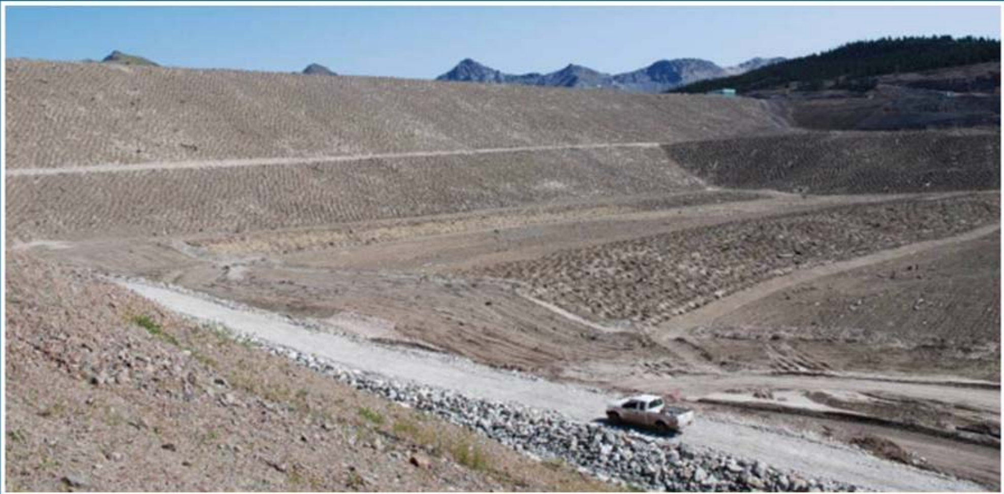
Final dam surface, August 2009