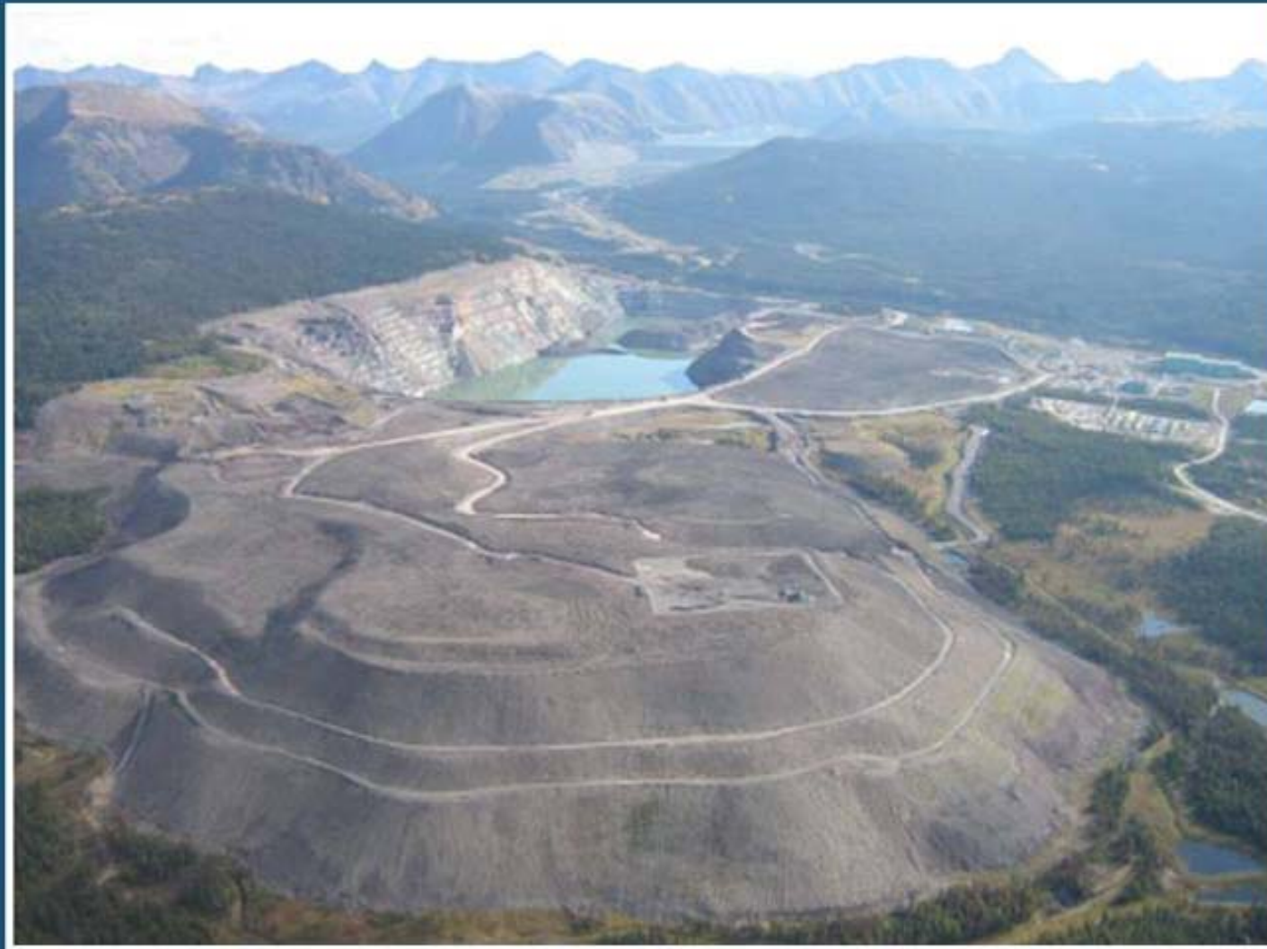
Waste rock dump following surface preparations and planting