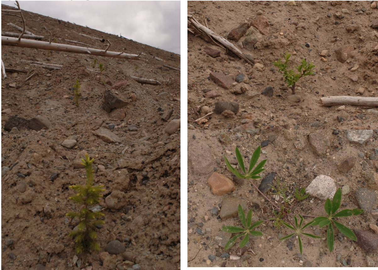
Photo 2. Dam face rough and loose preparation, coarse woody debris, and vegetation (white spruce, arctic lupine and willow)

Observations made in early August 2009 indicated that the seedlings and plugs were doing well and that native vegetation had started to appear on the prepared dam surface, and this has been confirmed by observations made in June 2010 (Photo 2). This suggests that the rough and loose surface preparation technique does create favourable conditions for capturing the seeds of wind-borne species. Some supplementary planting of native species is planned for future years, however it is expected that the density of native species will increase with gradual ingress over time. Additional observations will be conducted in the summer of 2010 to assess the success rates of planted native species and to monitor ingress and infilling of plant cover over the reclaimed surface.