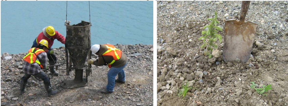
Photo 3. Soil delivery to Borrow 3 via helicopter and soil pocket planting with native species

Borrow 3 is located on the north side of the Tailings Storage Facility (TSF). This borrow was one of the rock and overburden sources used during early construction of the TSF. Later borrow development consisted of mining talus for filter materials. Machine reclamation work was carried out in this area in 2005, including recontouring of old borrow benches and development trails. The steep rocky slope section of Borrow 3 was addressed during the 2009 reclamation activities. The objective of the 2009 program was to create micro-sites or “pockets” for establishment of vegetation on the exposed rock slope. Some pockets of vegetation have already established naturally in this area, and the intent was to augment these with additional sites. A lack of a suitable growth medium at the borrow area meant soil had to be moved to the site. Overburden from the mine site was mixed with water to form a slurry in preparation for relocation. Due to difficult access, a helicopter was used to sling the slurry to the borrow. Approximately 7 m 3 of soil was moved to create roughly 150 planting sites (Photo 3).