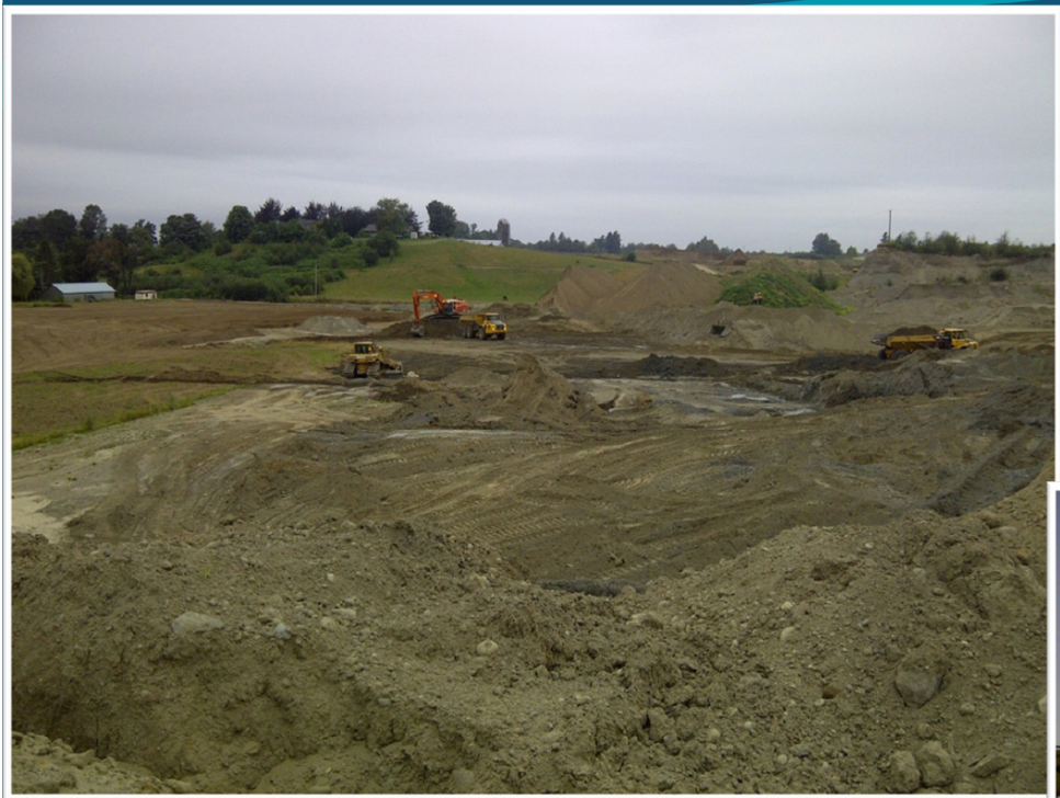
Cut and fill completed to level disturbed area