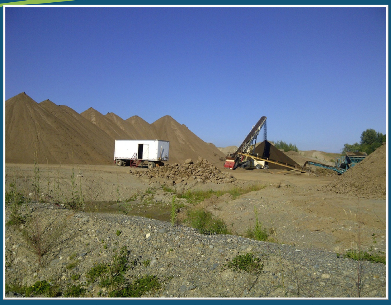
Extensive soil screening completed to create suitable topsoil