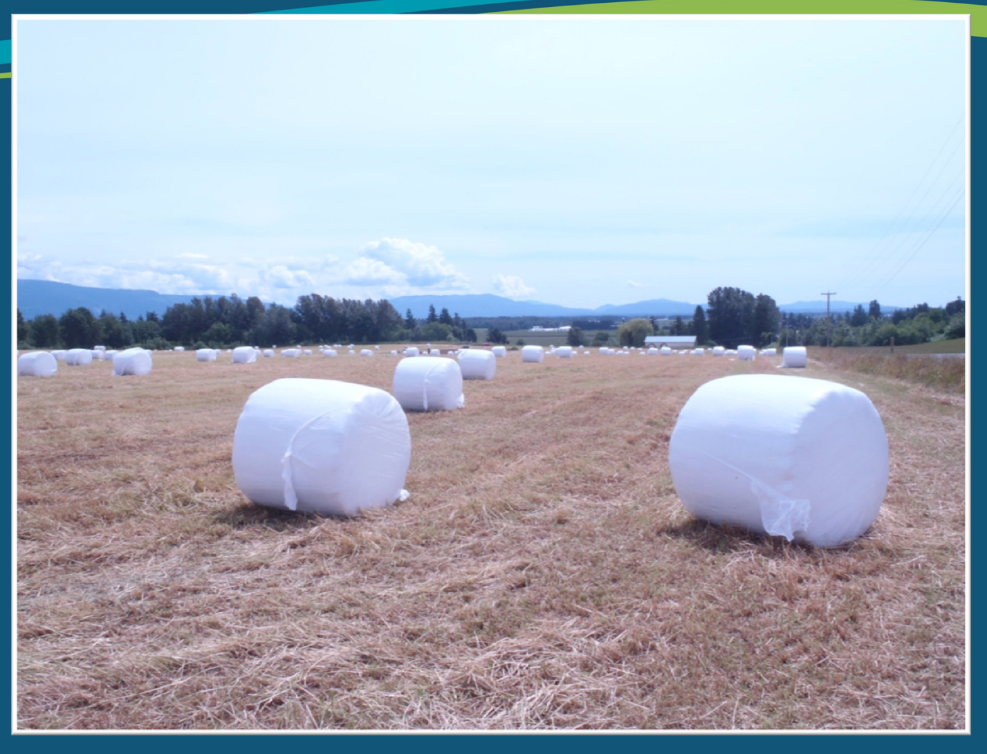
2014, first cut of hay bales produced