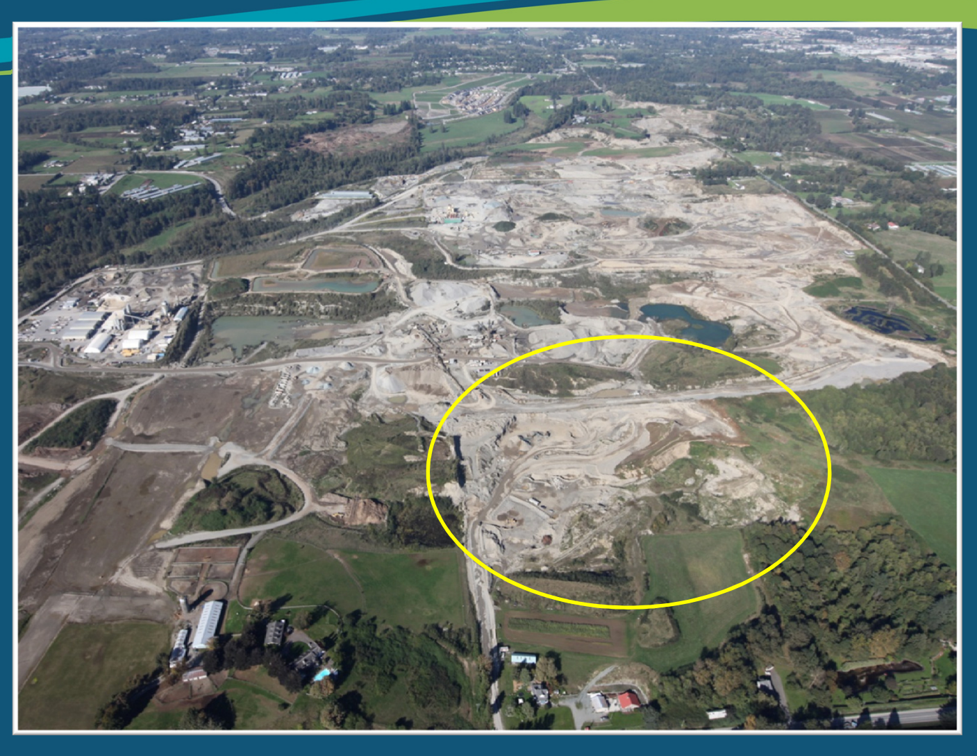
2010 air photo of disturbance area.