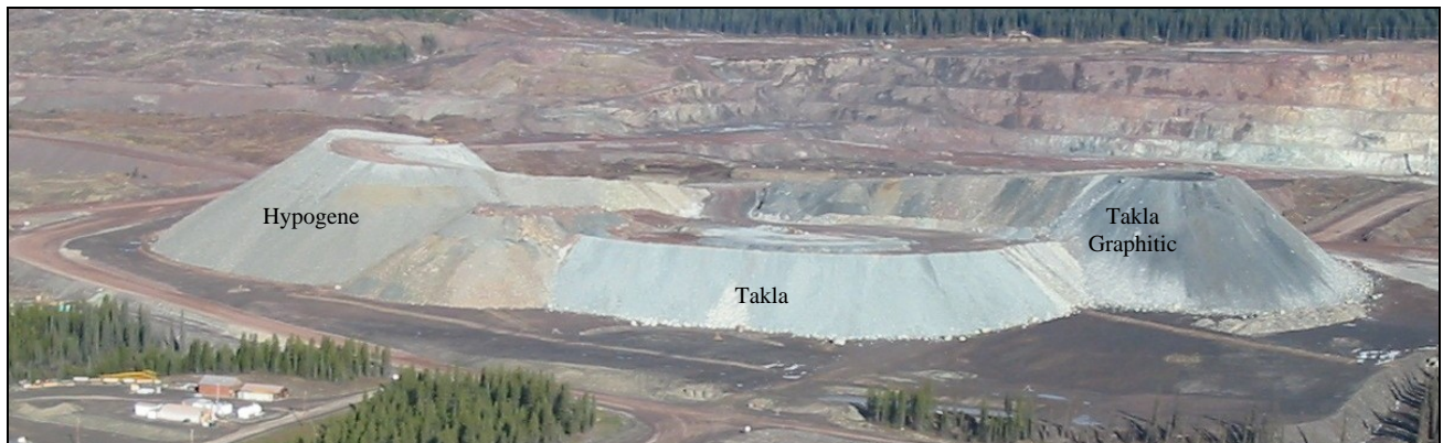
Plate 1: Low Permeability Ex-Pit PAG Dump (Showing Drainage Control And Collection Pond)

The rock types present at the Kemess Mine have been classified into 7 types of waste and 4 types of ore. The individual materials and their area of concern are listed in Table 1 below and the following Plate 1 illustrates the segregation and temporary storage of the PAG waste materials.