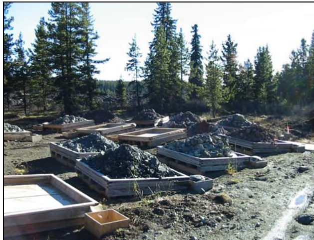
Plate 2: Field Test Pads (2002)